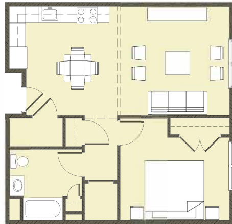
Typical 1 Br Apartment